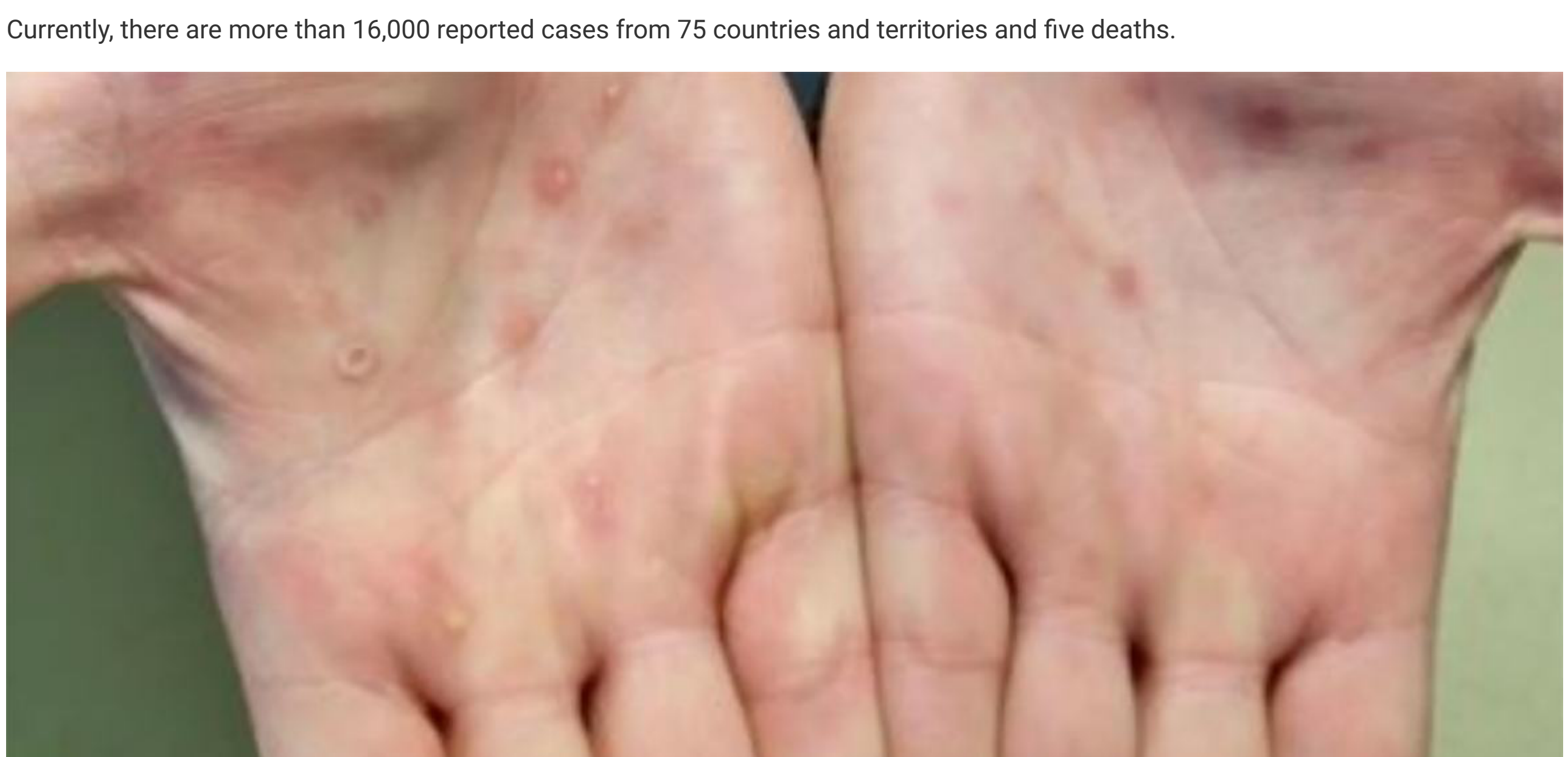
Monkeypox lesions often appear on the palms of hands.

"There is also a clear risk of further international spread, although the risk of interference with international traffic remains low for the moment", he added.