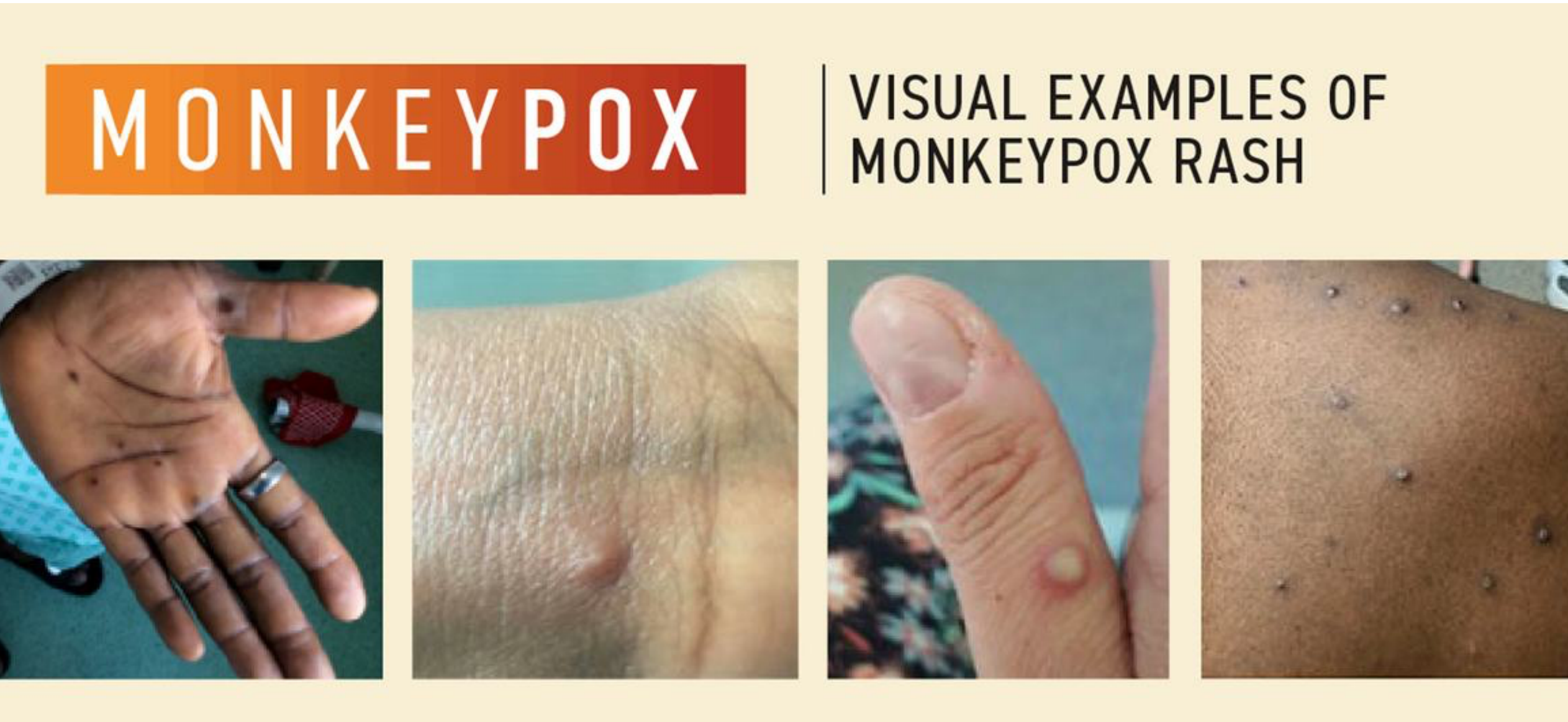
CDC: NHS England High Consequence infectious Diseases Network | The World Health Organization (WHO) continues to work with patients and community advocates to develop and deliver information tailored to communities affected by monkeypox.

"With the tools we have right now, we can stop transmission and bring this outbreak under control", he highlighted.